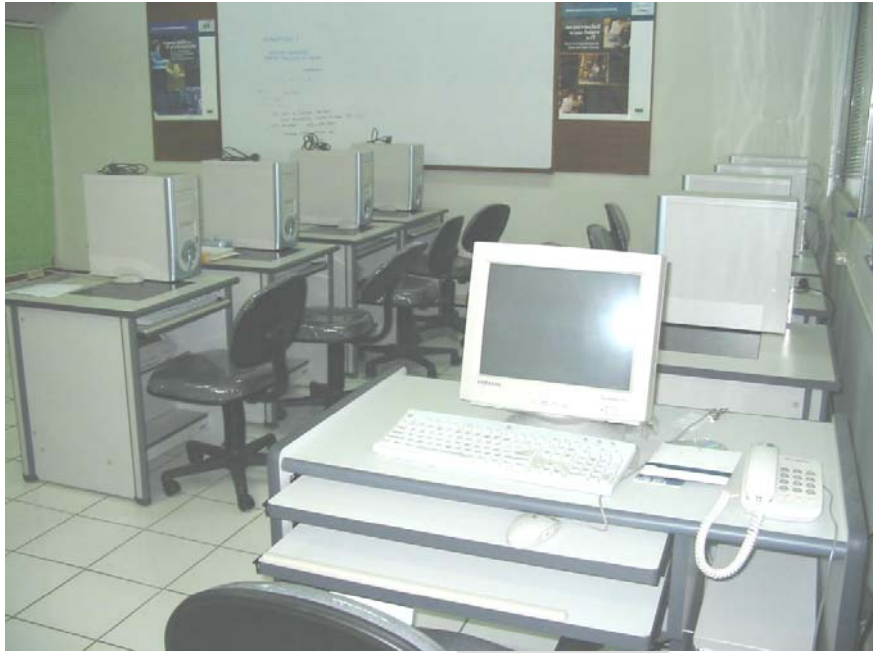
Gambar 2. Laboratorium Sistem Komputasi & Rekayasa Perangkat Lunak