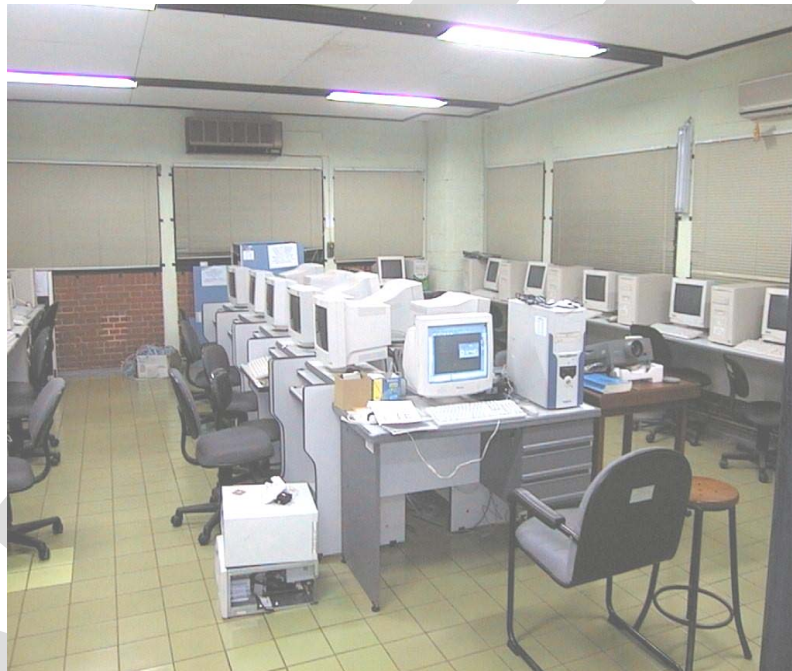
Gambar 4.1. Laboratorium Jaringan Komputer

22 Komputer Pribadi mutakhir terhubung jaringan lokal. 6 CISCO-2500 routers, 1 CISCO-1700 router, 2 CISCO Catalyst-1900, Protocol Inspector, ADTRANS dan ISDN.