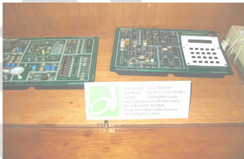
Gambar 3. Laboratorium Dijital

13 Komputer Pribadi mutakhir untuk akses Internet, 2 Sun Ultra-5 dan 2 Sun Ultra-60 stations untuk perancangan rangkaian dan sistem digital, modul pelatihan IP-versi-6 , peralatan dasar untuk praktikum digital: advanced logic analyzer, logic tutor, counters, PAL/GAL trainers.