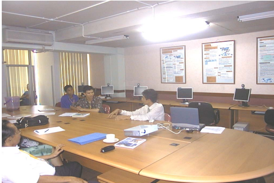
Gambar 4. Laboratorium Multimedia