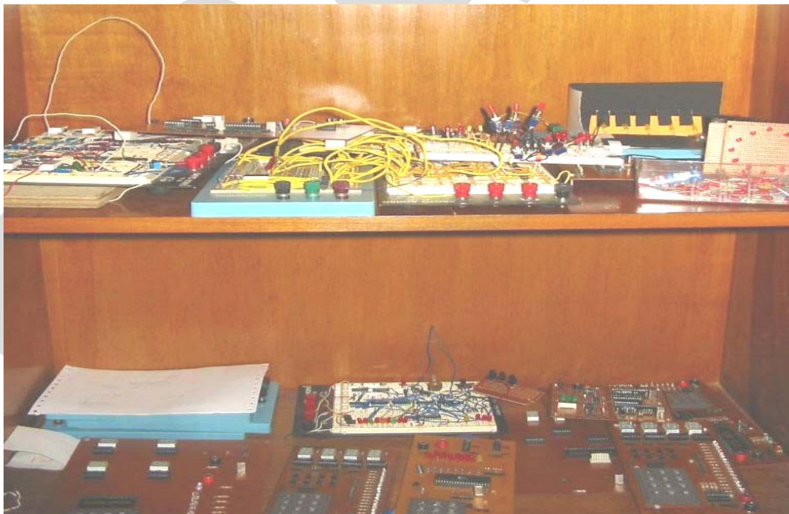
Gambar 4.5. Laboratorium Microprocessors & Embedded Systems

Peralatan dasar praktikum mikroprosesor dengan Turbo Assembler 8051 IDE . Peralatan dasar praktikum antarmuka Teknik Elektroprosesor. Chip Master 6000 intelligent universal programmer, oscilloscopes, function generators, logic analyzer .